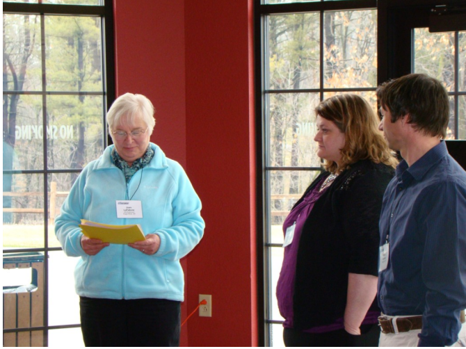
INSTALLATION OF OFFICERS