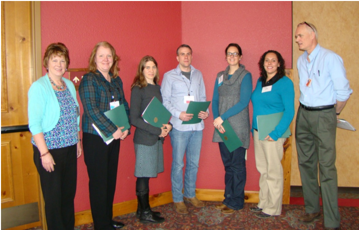
INITIATION OF NEW MEMEBERS