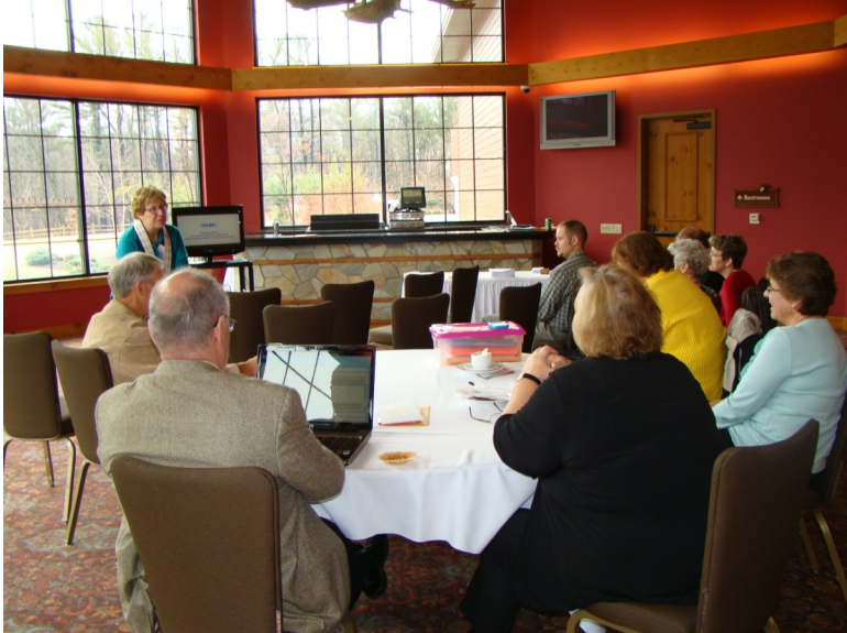
ESP HISTORY DISCUSSIONS